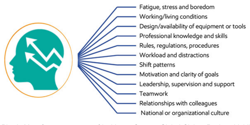
Pic. 2. Most frequent causes of incidents. Source: Global Claims Review: Liability in marine industry. Given the Focus, Allianz Global Corporate & Specialty

And after considering all the factors affecting the safety of workers in the production process, well, we can think about what should be the government strategy for implementing a safety culture in the marine industry. Given the field, the subjectivity of the marine industry and the